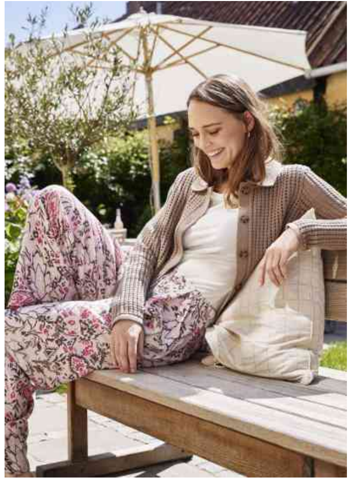
20617564 - FRLAYLA CAR 1 / 20617660 - FRBRIA TEE 1 / 20615422 - FRARIANA PA 3