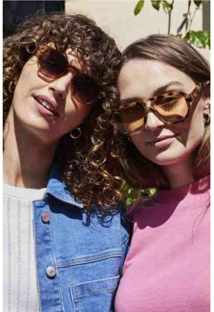
20617546 - FLORELEI JA 1 / 20617511 - FRCAMMY PU 1 / 20617967 - FRARIA SUNGLASS 1