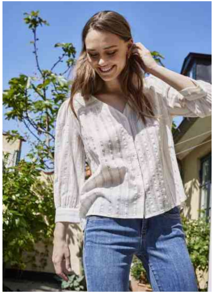
20617500 - FRADI SH 1 / 20617816/FRATLANTA PAM JE 3