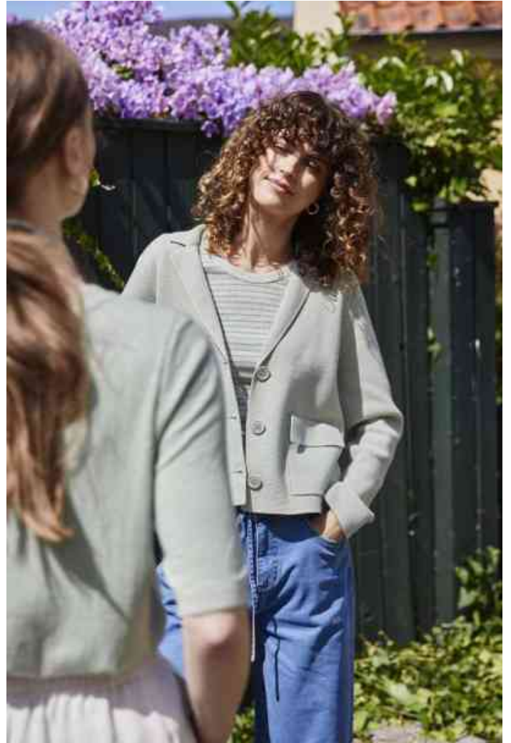
20617690 - FRITA CAR 10 / 20617669 - FRHOZANA TEE 3 / 20617545 - FRVOCUT ROME JE 6