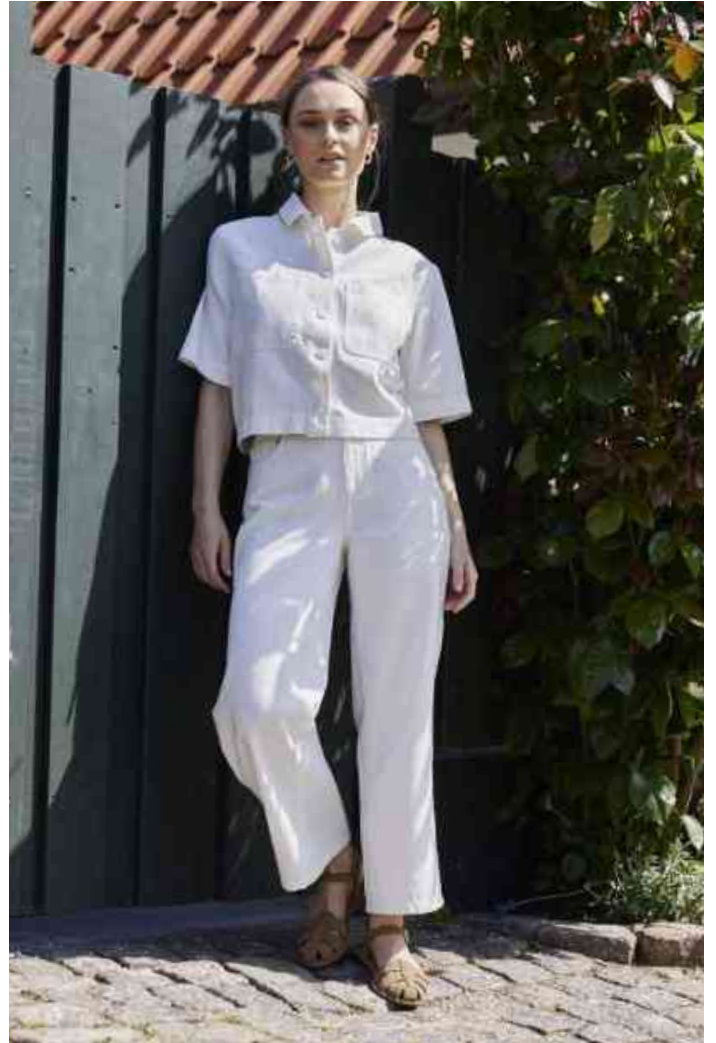
20617910 - FREVELYN SH 1 / 20617907 - FREVELYN PA 1