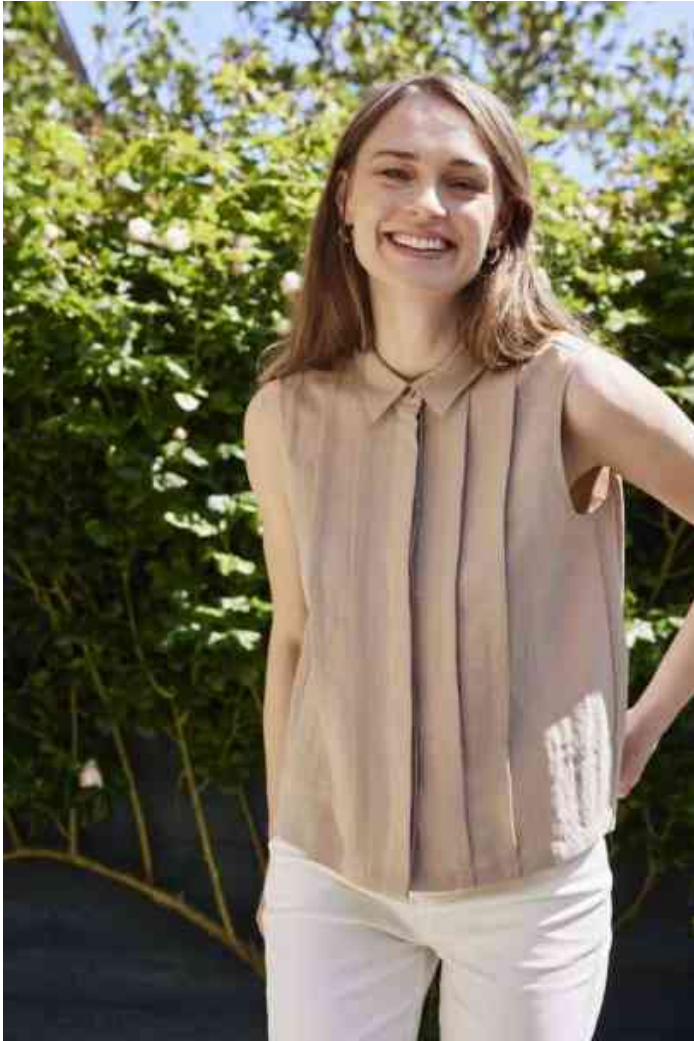
20617680 - FRADAH BL 1