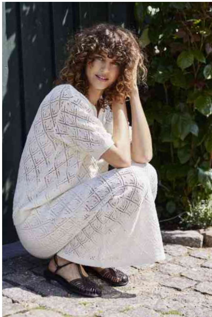
20617571 - FRJESSICA PU 1 / 20617654 - FRJESSICA SK 1