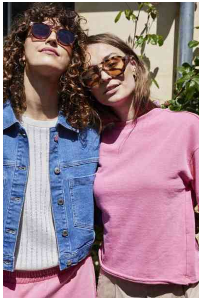
20617663 - FRSERAFINA PU 2 / 20617961 - FRALDINA SUNGLASS 1