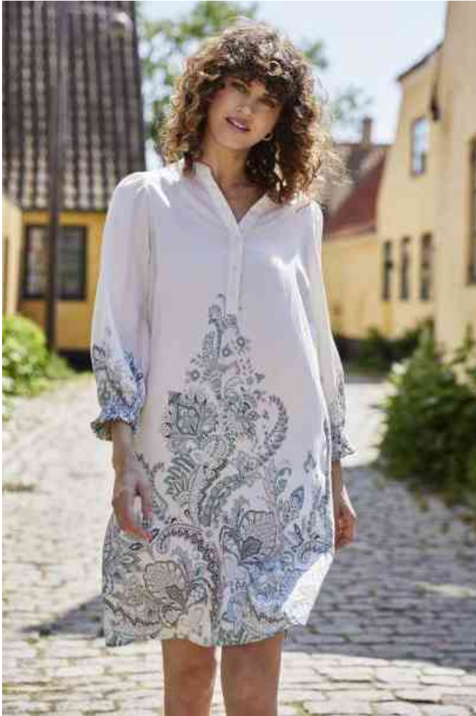
20617733 - FRADARA DR 2