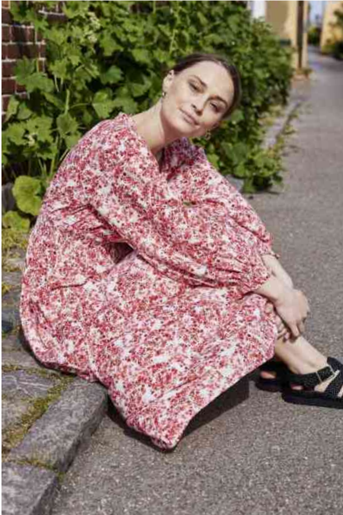
20617548 - FRMERLE DR 3