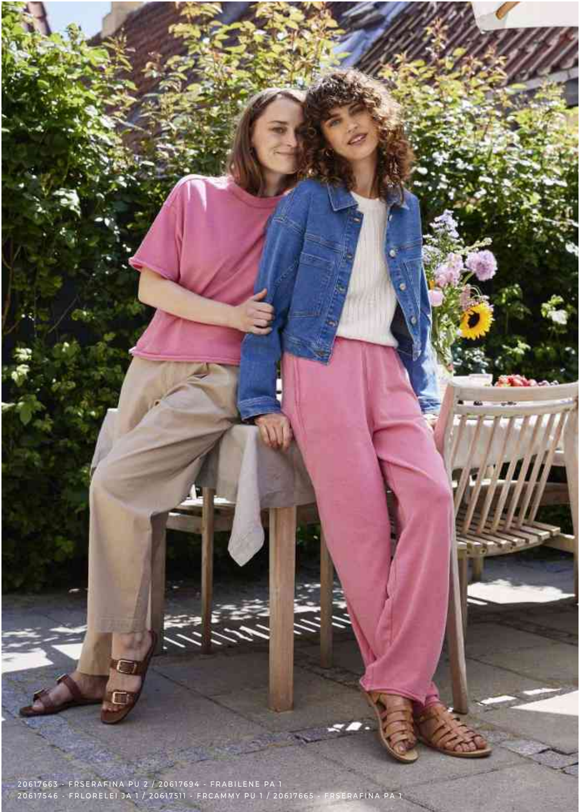
20617663 - FRSERAFINA PU 2 / 20617694 - FRABILENE PA 1 20617546 - FRLORELEI JA 1 / 20617511 - FRCAMMY PU 1 / 20617665 - FRSERAFINA PA 1