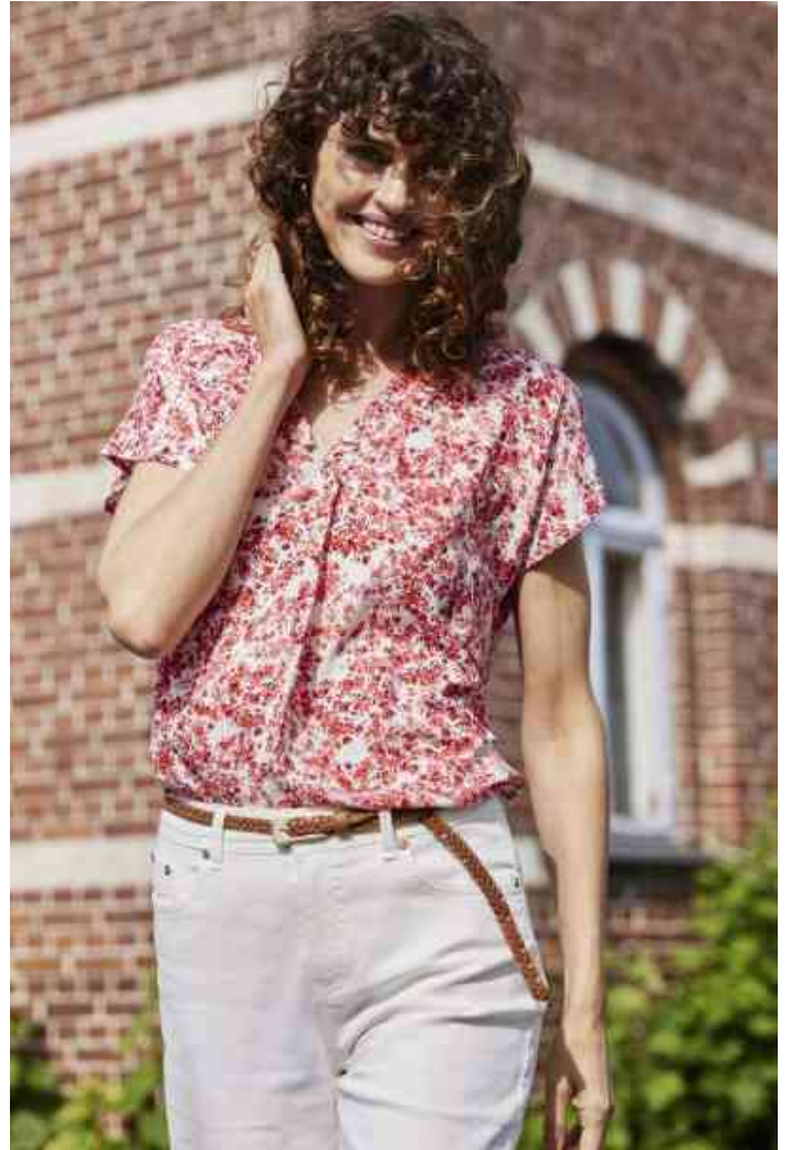
20617611 - FRCHICAGO HANNA JE 3 / 20617549 - FRMERLE SH 2 / 20617901 - FRALMIRA BELT 1