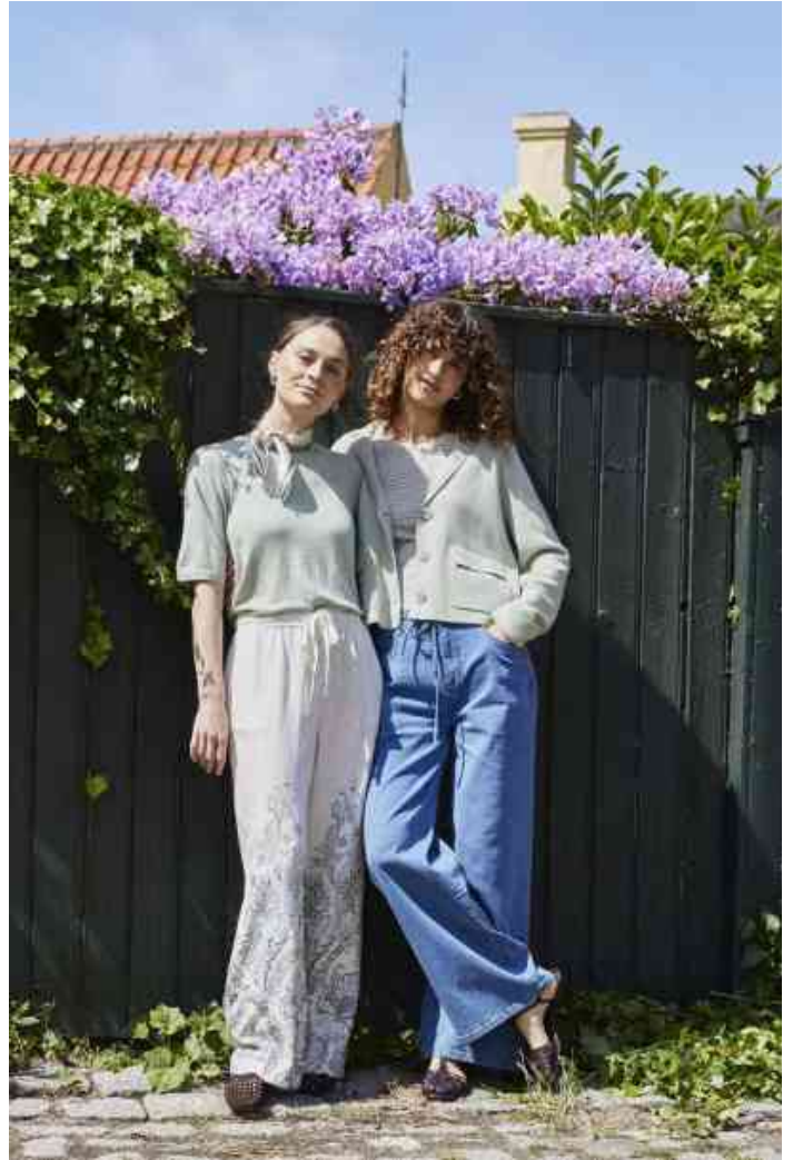
20617452 - FRMARY PU 5 / 20617732 - FRADARA PA 1