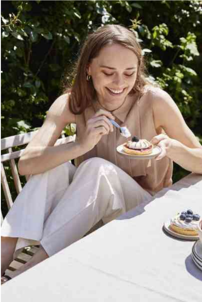
20613554 - FRLUXE ELLI JE 1