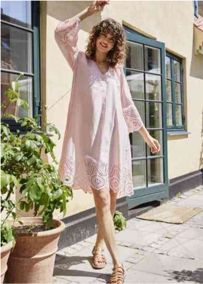
20617607 - BOHEME DR 1